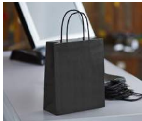
Retail Accessories ›