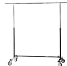
Adjustable Clothes Rails