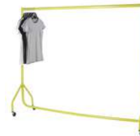
Coloured Clothes Rails