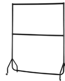
Two-Tier Clothes Rails