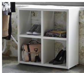
Cube Shelving ›