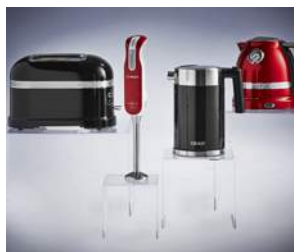
Acrylic Display Stands ›