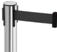
Retractable Barrier Posts