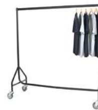
Reinforced Heavy-Duty Rails