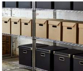
Chrome Shelving ›